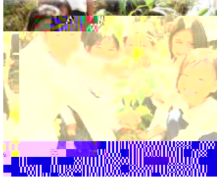
Children planting trees in the Children's Forest project.