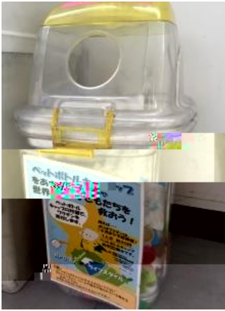
Box for collection of PET bottle caps.